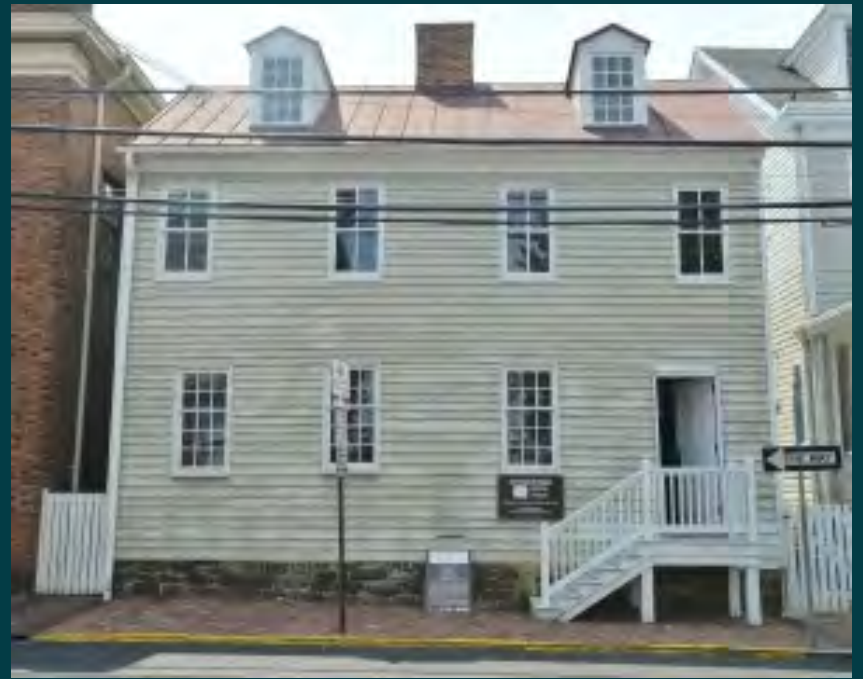
Maynard-Burgess House fronting onto Duke of Gloucester Street

Client: The Maryland Trust for Historic Preservation, the City of Annapolis and the Historic Annapolis Foundation.